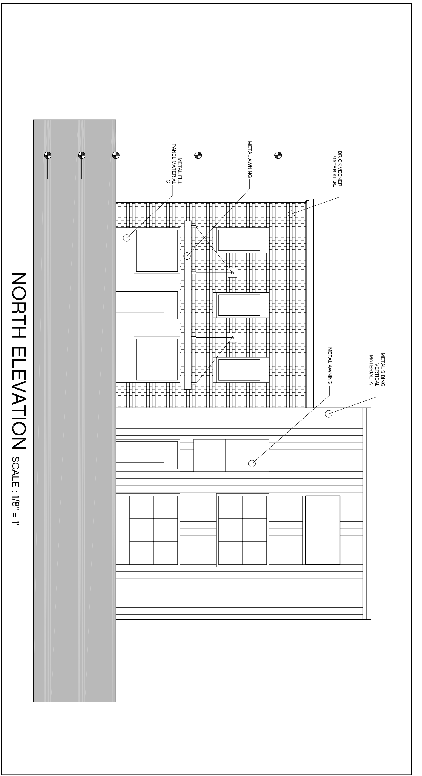
NORTH ELEVATION SCALE : 1/8" = 1'