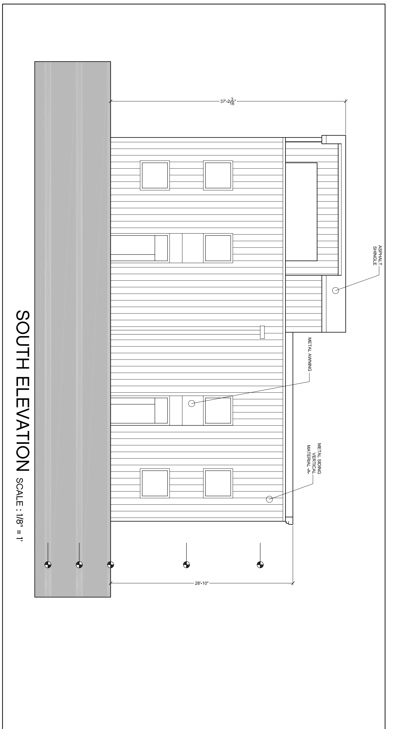
SOUTH ELEVATION SCALE : 1/8" = 1'